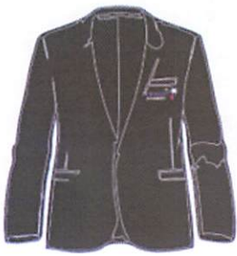
Blazer – Black with Academy Logo