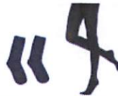
Socks/Tights – Plain Black