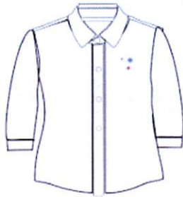
Shirt/Blouse – White formal style with stiff collar and top button suitable for a tie (with or without logo)