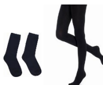
Socks/Tights – Plain Black. Socks with no frills or logos (no other colour or pattern)

No Nike Air Force 1 type shoes are allowed