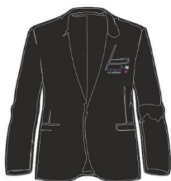
Compulsory Black Furness Academy Logo Blazer