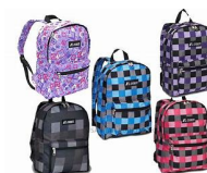
School Bag – Must be rucksack (any colour)

Students are required to wear their blazers. This must be worn throughout the school day except where permission has been given by a member of staff. If a student wishes to remove their blazer, they should politely ask their teacher. Shirts must be tucked in at all times with the top button fastened.